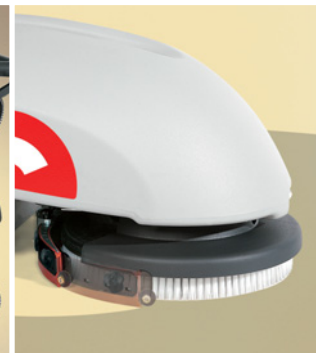
Vispa 35 B Parabolic squeegee The parabolic squeegee swinging around the brush ensures perfect drying even on bends