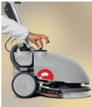
Vispa 35 E The breath valve on the cap of the solution tank always guarantees the same quantity of water on the floor for a constant cleaning operation

Thanks to the automatic squeegee and brush adjusting system, the machine can automatically adjust to any type of floor.