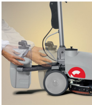
Vispa 35 E The dirt is collected into the recovery tank that can be easily removed to be simply emptied