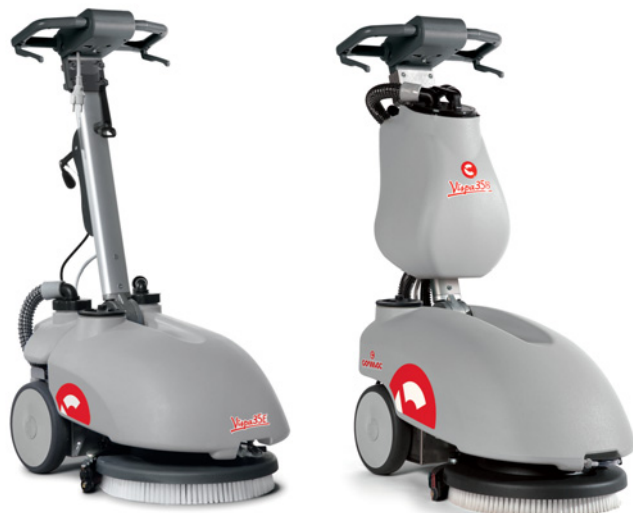
Vispa 35 E

Vispa 35 E/B is extremely compact in size and can be parked also vertically. ATTENTION: in the battery version this operation can be made only with gel battery