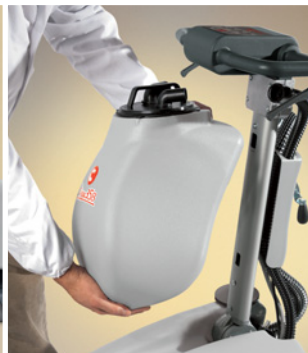
Vispa 35 B