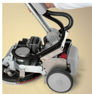
Vispa 35 B The battery compartment is easy to reach for quick battery replacement

Vispa 35 E is ideal for cleaning in tight and not excessively congested spaces and has a never ending autonomy ensured by the electric cable.